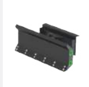
Small dozer blade