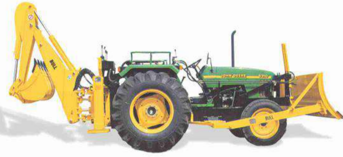
Backhoe Dozer Attachment