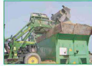
Material handling at Batching plant