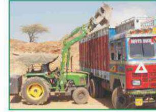
High Dumping @ 13.12Ft Tallest Loader in India