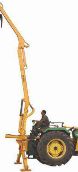
Radial Loader Attachment