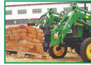
@ Construction Sites